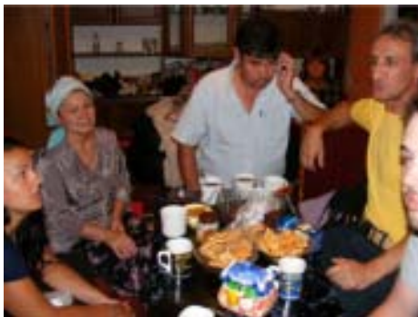
Christians of the church that used to be Muslim visited with us and shared their struggles.

God worked in and through us. He helped us teach the children in a fun way. Most were attentive. Some wanted to talk about their decision for Christ, and the church people with the interpreters helped us do that. Because the Bible school was held in a courtyard, parents and people on the street observed and listened. We had opportunities to talk with and pray for