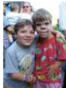
Children at the home loved to get their picture taken!

On the plane ride home, my devotion was on the Beatitudes. (Matthew 5:1–12) After my experiences, I see these verses in a new light. Verses 3, 4, 6, 10, and 11 talk about struggles that result in blessings. I saw this in Ukraine. Don't ever be sorry about trials. These are the times that God gets